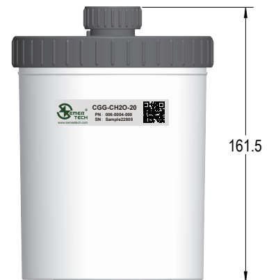
All dimensions in mm All tolerances ±0.30mm unless otherwise stated